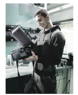
Wera 2go 1 - The outside packer